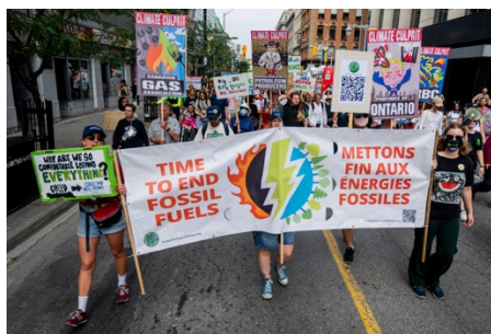
Protesters take part in a climate march in Ottawa on Sept. 21, 2024.